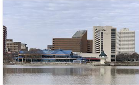
Pictured: Davis College’s campus in Toledo, Ohio; on the banks of the Maumee River.

Davis College offers a promising opportunity to students entering higher education.