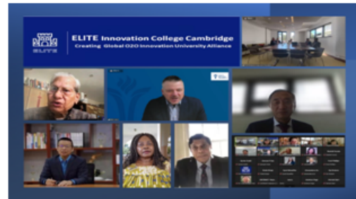
Pictured: Attendees of EICC's September 2022 Commencement event expressed their excitement for the start of the new academic year.

The program prompts students to begin developing these skills prior to fully enrolling in EICC's degree programs.