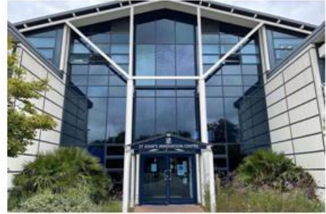
Pictured: St. John's Innovation Centre, Cambridge, UK.