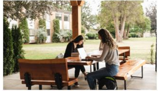
Pictured: Students study at one of the many outdoor locations in TWU's campus.