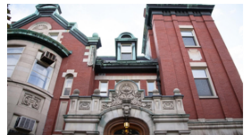
Pictured: Located near historic Fort Langley, TWU's Langley campus includes examples of noteworthy architecture.