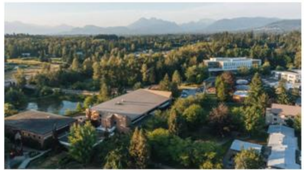
Pictured: An aerial view of TWU's Langley campus in British Columbia, Canada.

GXP Pathway provides significant cost savings for students.