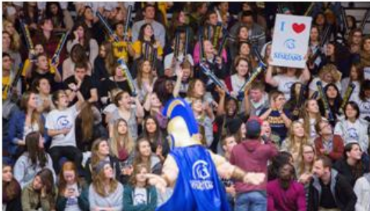
Pictured: Students cheer for TWU's athletic programs at Langley Events Centre. Community events at TWU are large and frequent.