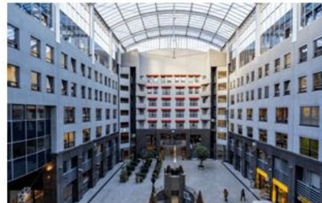
Pictured: IU campus accommodations at the Berlin campus location.

This offers students significant flexibility in scheduling their coursework and exams for their degree.