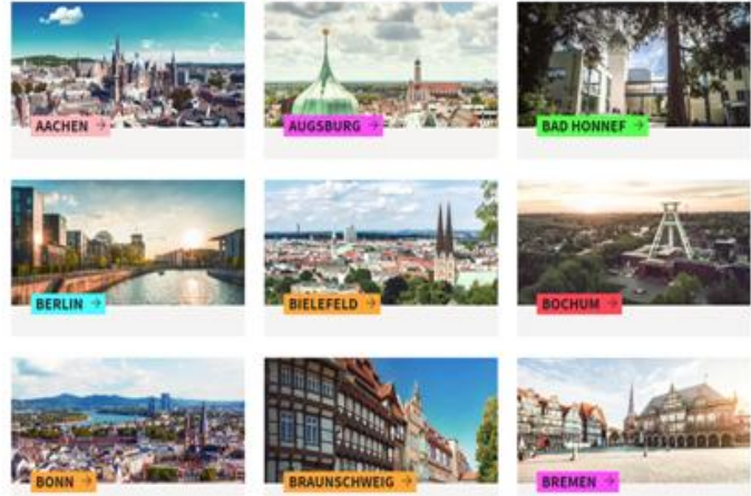
Pictured: A sample of IU's 28 total campuses in Germany.