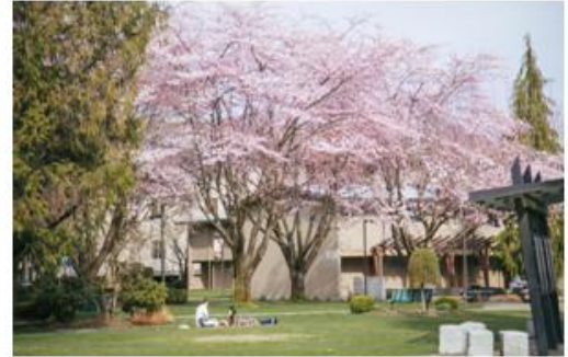
Pictured: Colorful foliage surrounds the TWU Campus.