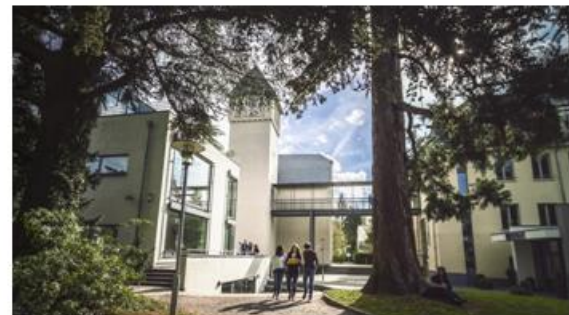
Pictured: Students walk between buildings at IU's campus in Bad Honnef, Germany.

Flexible scheduling, pricing, and payment format provide an accessible option for many students.